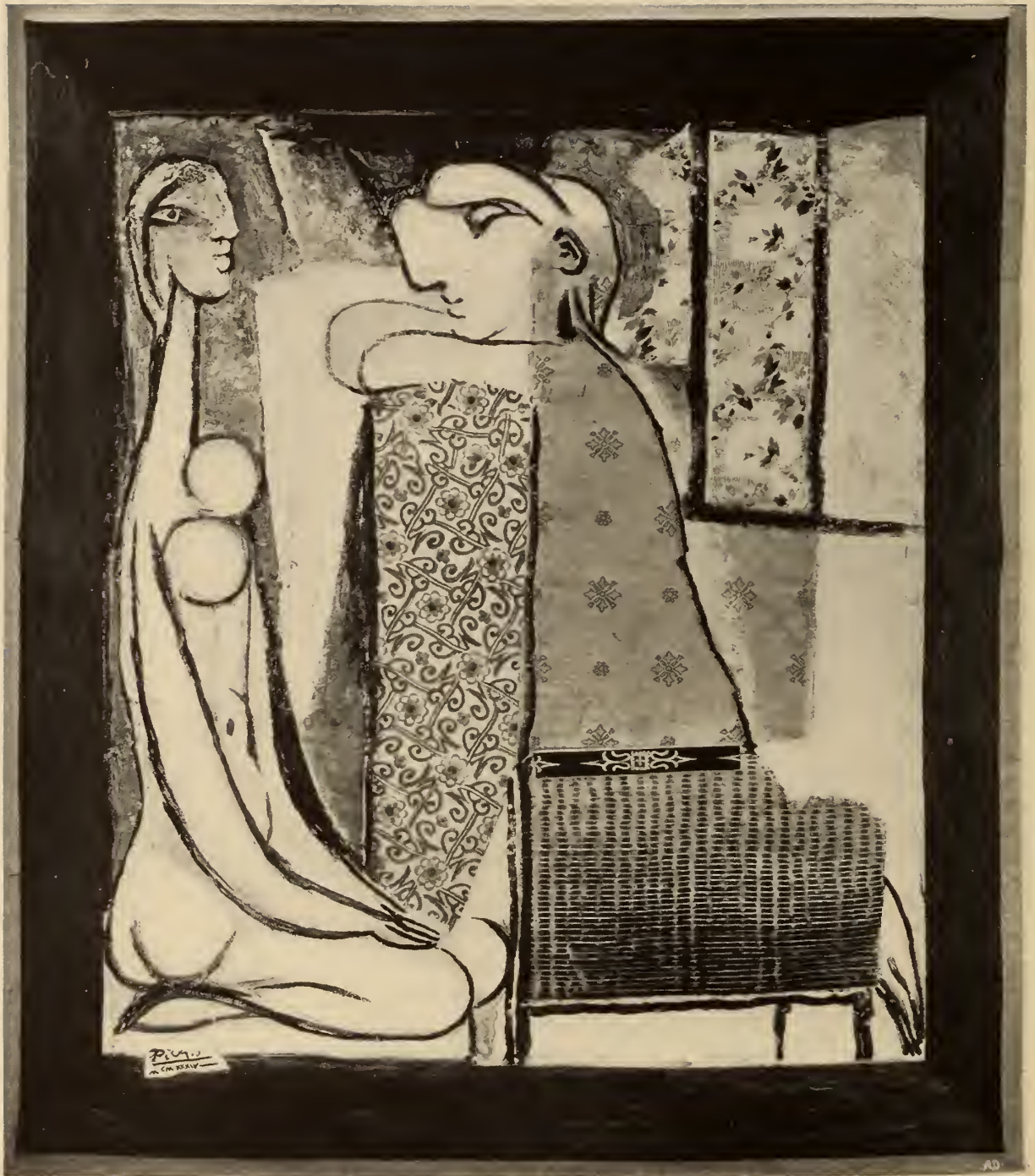
PABLO PICASSO — " Inspiration "